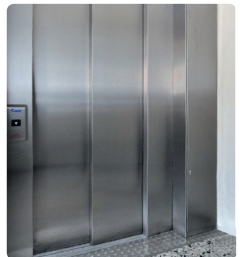
Door entrance with front-attached lift controller